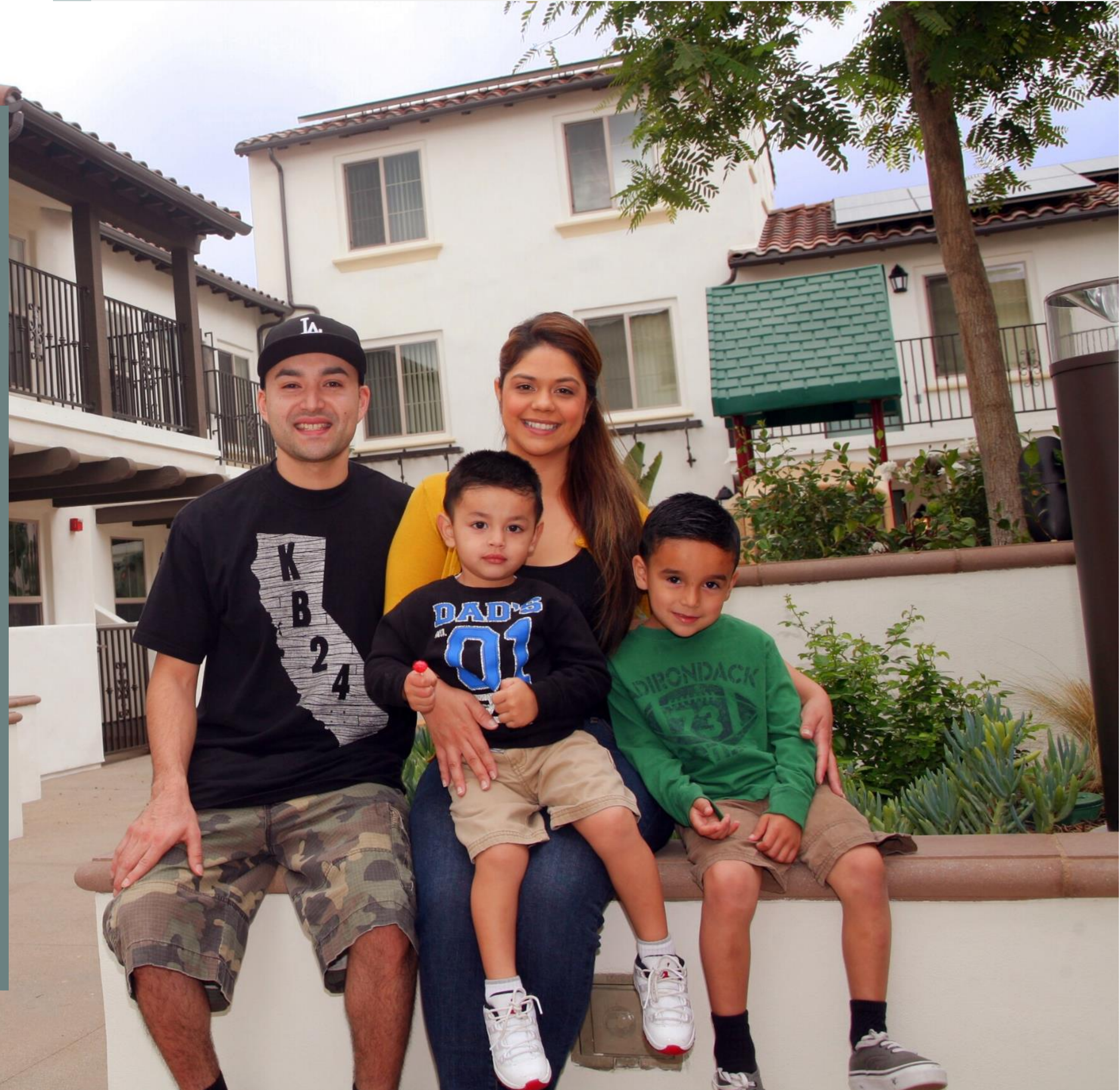
Photo Taken at Mosaic Gardens at Whittier

Our vision is to build communities and strengthen neighborhoods for people underserved by the marketplace.