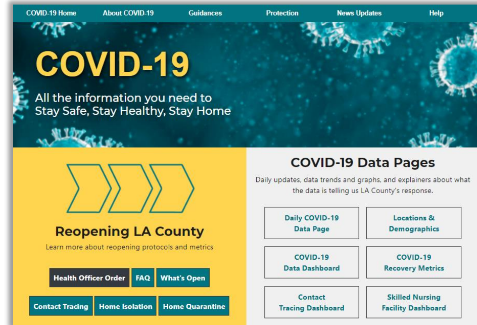
New user-friendly layout