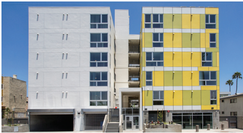
Vista Ballona Community Corporation of Santa Monica Mar Vista, Los Angeles County

The RISE is an affordable housing community providing permanent supportive housing and case management services for chronically homeless veterans and unhoused community members. The development also serves as the headquarters for the local nonprofit Rise Financial Pathways. The nonprofit offers comprehensive and innovative ways to build wealth for historically underserved residents and small business owners in South L.A. and across Los Angeles County. The Rise creates a unique space where social equity meets green construction and serves as a prime example of affordable housing and green building working in harmony. The deep affordability at 30% and 50% area median income gives chronically homeless individuals and veterans permanent housing while also providing them with case management services and other amenities. It features multiple outdoor decks, a courtyard, and large windows in every apartment.