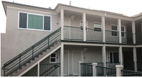
1616 Ocean Community Corp. of Santa Monica Santa Monica, Los Angeles County

1616 Ocean is Community Corporation of Santa Monica's first all-electric retrofit of an existing building in a prominent ocean-view location. The development is next to the Santa Monica Pier, and as such, is a prominent location and opportunity to showcase affordable housing to the community at large. This location says affordable housing belongs in ALL parts of the neighborhood. Community Corporation of Santa Monica purchased the building from the City of Santa Monica. It was originally run as an adult care facility but the City decided it over after decommissioning the care center. The building was in need of substantial rehabilitation, earthquake retrofitting, ADA retrofits, and the developer took the opportunity to also remove all the natural gas components of the building to create healthier, all-electric housing.