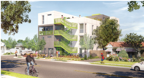
Watts Works Decro Corporation Culver City, Los Angeles County