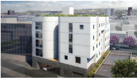
11010 Santa Monica Boulevard Weingart Center Association City and County of Los Angeles

1616 Ocean is Community Corporation of Santa Monica's first all-electric retrofit of an existing building in a prominent ocean-view location. The development is next to the Santa Monica Pier, and as such, is a prominent location and opportunity to showcase affordable housing to the community at large. This location says affordable housing belongs in ALL parts of the neighborhood. Community Corporation of Santa Monica purchased the building from the City of Santa Monica. It was originally run as an adult care facility but the City decided it over after decommissioning the care center. The building was in need of substantial rehabilitation, earthquake retrofitting, ADA retrofits, and the developer took the opportunity to also remove all the natural gas components of the building to create healthier, all-electric housing.