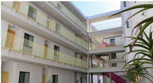
Rosa de Castilla Apartments East Los Angeles Community Corporation City and County of Los Angeles

Prado is the first affordable housing development in Fountain Valley in 16 years, with eight of the 50 units designated as permanent supportive housing for veterans who are homeless or at risk of homelessness. The development is a prototype for affordable housing on a tight infill site with two easements: Southern California Edison's easement running through the center of the property with existing power pole and power lines, and a sewer easement along the eastern property line. The design accommodated both easements as well as a 14' x 48' billboard located on the site and removed during lease-up. The garden style buildings were carefully placed throughout the property and easements to create inward facing open courtyards, as well as a parking and landscape buffer to the Santa Ana River Trail. Residents have prime access to transit and the 30-mile, public Santa Ana River Trail that offers recreation opportunities for bicyclists, runners, and walkers.