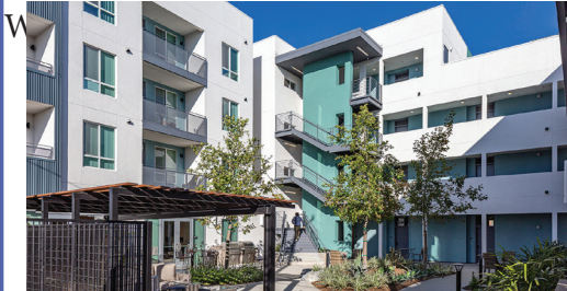
PATH Villas South Gate PATH Ventures South Gate, Los Angeles County

Located in the City of South Gate, along a portion of Imperial Highway lined with light manufacturing buildings and automotive repair shops, this urbane, pedestrian friendly, four-story, 60-unit development will serve as a catalyst for the transformation of the neighborhood by providing supportive housing for homeless veterans and homeless individuals with mental illness. Residents are given access to numerous critical, life-changing services, including substance abuse, mental health care, Veterans Administration programs, health and wellness programs, transportation planning, and more. The building has been designed around a central courtyard that is lined with apartments and interior communal space. All of the new homes have large windows and private balconies, allowing breezes and natural light to flood the interiors. Residents can relax on their private balconies with views of the tree-filled courtyard or the cityscape beyond. A large multi-purpose room opens directly to the courtyard, where tenants can engage with one another and participate in a variety of resident activities.