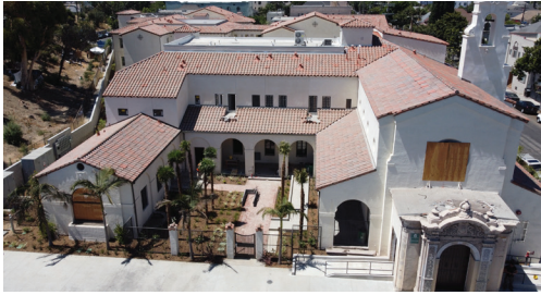
Washington View Apartments Western Pacific Housing, LLC City and County of Los Angeles