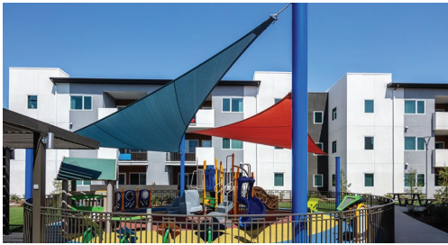
Prado Related California Fountain Valley, Orange County

Prado is the first affordable housing development in Fountain Valley in 16 years, with eight of the 50 units designated as permanent supportive housing for veterans who are homeless or at risk of homelessness. The development is a prototype for affordable housing on a tight infill site with two easements: Southern California Edison's easement running through the center of the property with existing power pole and power lines, and a sewer easement along the eastern property line. The design accommodated both easements as well as a 14' x 48' billboard located on the site and removed during lease-up. The garden style buildings were carefully placed throughout the property and easements to create inward facing open courtyards, as well as a parking and landscape buffer to the Santa Ana River Trail. Residents have prime access to transit and the 30-mile, public Santa Ana River Trail that offers recreation opportunities for bicyclists, runners, and walkers.