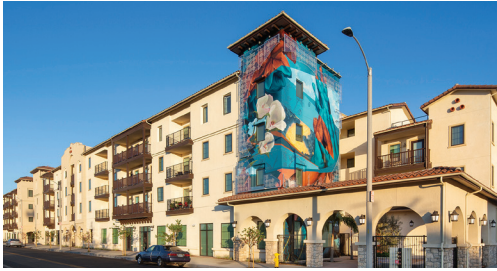
Fairview Heights Linc Housing and National CORE Inglewood, Los Angeles County

Fairview Heights in Inglewood, which features a four-story augmented reality public art mural, is a new transit-oriented affordable and supportive housing apartment complex with 101 homes, including 50 units for people who have experienced homelessness. The development features more than 6,300 square feet of community-serving space, including offices for local nonprofit One For All, an Inglewood Police Department Community Drop-In Center, and planned Workforce Innovation & Talent Center in partnership with CVS Health. Located directly across from the new Fairview Heights/LAX Metro Station, the design sought to be a landmark building providing a sense of arrival and place, similar to the role played by old train stations. The building takes its cue from traditional Spanish Mission design featuring a light color scheme, projecting wood balconies, arches, and clay tile roofs. Fairview Heights replaced an aging county building.