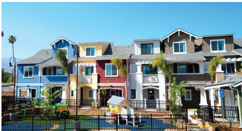
Mountain View Apartments Many Mansions Fillmore, Ventura County

Missouri Place, located in West Los Angeles, is a 6-story, 74-unit affordable and permanent supportive housing development that showcases how design excellence benefits the community and the spirits of its residents. This project is extra special because it was one of the first supportive and affordable housing projects in the City of Los Angeles to use both HHH funds and the Transit Oriented Communities (TOC) land use incentive program. The project is also special because it is a mix of supportive and affordable housing for both individuals and families developed in West Los Angeles, a high resource area with community groups that have traditionally opposed affordable housing. It includes 44 units for formerly homeless individuals and families along with 29 units for low-income households and one manager unit. The community overwhelmingly supported the project after significant collaboration over many months to arrive at a design and a population mix that represented a true “win-win” to positively impact the community.