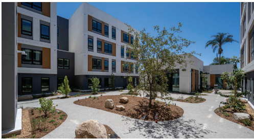
Casa Paloma American Family Housing Midway City, Orange County

Cadence – with construction and services funded via Measure H, Proposition HHH and No Place Like Home funds – is in the Watts neighborhood of Los Angeles, and features 63 permanent supportive homes for people who have experienced homelessness, with 31 reserved for those with mental illness. Cadence was named to honor Central Avenue’s heritage as the hub of the West Coast jazz scene in the early 20th century. In addition to 63 permanent supportive homes and one manager’s unit, the building also has a community room with kitchen, a computer room, outdoor courtyards, indoor bicycle parking, offices for case management, and convenient access to public transportation, shopping, and community services. Unique to Cadence is the design of the case management spaces. The three offices for the intensive case management services (ICMS) team have all-glass walls and open up to each other. This design creates an open and welcoming atmosphere that fosters relationships and encourages residents to drop in for support more often because they can see who’s available.