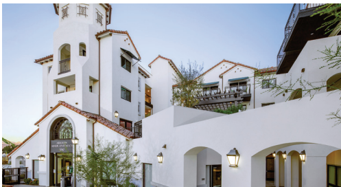
Arboleda Senior Apartments Meta Housing Corporation La Puente, Los Angeles County

Amani Apartments is one of the first affordable housing communities in Los Angeles to combine supportive housing for unhoused seniors with a Program of All-Inclusive Care for the Elderly (PACE), a specialized senior healthcare system, which has proven highly successful at stabilizing seniors living in supportive housing by providing on- and off-site services, such as medical care, behavioral health, in-home care, and transportation. This model is highly successful at resident retention (90% or higher after one year of operation) and stabilizing residents by offering a wide variety of services. In terms of obstacles overcome, the project site was severely contaminated with environmental hazards, including high levels of lead and cadmium impacted soils due to its previous use as a gas station. The soils required large-scale mitigation and extensive oversight and testing by the California Department of Toxic Substances Control.