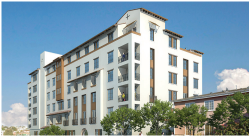
Firmin Court Decro Corporation City and County of Los Angeles

Fairview Heights in Inglewood, which features a four-story augmented reality public art mural, is a new transit-oriented affordable and supportive housing apartment complex with 101 homes, including 50 units for people who have experienced homelessness. The development features more than 6,300 square feet of community-serving space, including offices for local nonprofit One For All, an Inglewood Police Department Community Drop-In Center, and planned Workforce Innovation & Talent Center in partnership with CVS Health. Located directly across from the new Fairview Heights/LAX Metro Station, the design sought to be a landmark building providing a sense of arrival and place, similar to the role played by old train stations. The building takes its cue from traditional Spanish Mission design featuring a light color scheme, projecting wood balconies, arches, and clay tile roofs. Fairview Heights replaced an aging county building.