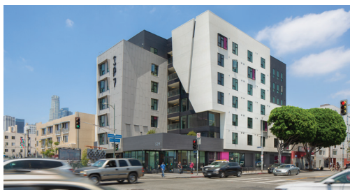
SP7 / San Pedro House Skid Row Housing Trust City and County of Los Angeles

Sierra Fountains is a new construction development in San Bernardino County that transformed a 4.66-acre blighted lot previously owned by San Gabriel Water Company into 60 affordable apartment homes for working families. The development features a 3,000-square-foot onsite health and wellness clinic in partnership with Cucamonga Valley Medical Group, and exteriors that reflect a modern agrarian aesthetic of barn-like structures derived from the rich history of local citrus farming and the farmhouse style found throughout the city of Fontana. Healthy living is supported with an array of outdoor amenities for recreation, including a swimming pool, dining and play areas, and green space. A large outdoor area with barbecues, community garden, and inviting landscaping provides additional outdoor space for resident activities and gatherings. Sierra Fountains is designed to achieve LEED (Leadership in Energy & Environmental Design) for Homes-certified Gold rating. Resident services are offered free to residents and those in the surrounding neighborhood, including tutoring, health/nutrition classes in the community kitchen, food distribution, community events, a gardening club, homework assistance, and tutoring for young people.