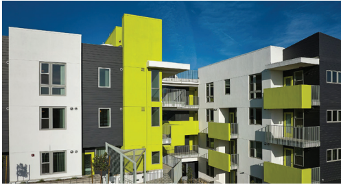
Cadence Linc Housing Long Beach, Los Angeles County

Cadence – with construction and services funded via Measure H, Proposition HHH and No Place Like Home funds – is in the Watts neighborhood of Los Angeles, and features 63 permanent supportive homes for people who have experienced homelessness, with 31 reserved for those with mental illness. Cadence was named to honor Central Avenue’s heritage as the hub of the West Coast jazz scene in the early 20th century. In addition to 63 permanent supportive homes and one manager’s unit, the building also has a community room with kitchen, a computer room, outdoor courtyards, indoor bicycle parking, offices for case management, and convenient access to public transportation, shopping, and community services. Unique to Cadence is the design of the case management spaces. The three offices for the intensive case management services (ICMS) team have all-glass walls and open up to each other. This design creates an open and welcoming atmosphere that fosters relationships and encourages residents to drop in for support more often because they can see who’s available.