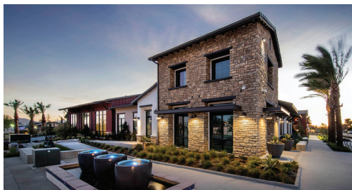
Sierra Fountains Jamboree Housing Fontana, San Bernardino County

Sierra Fountains is a new construction development in San Bernardino County that transformed a 4.66-acre blighted lot previously owned by San Gabriel Water Company into 60 affordable apartment homes for working families. The development features a 3,000-square-foot onsite health and wellness clinic in partnership with Cucamonga Valley Medical Group, and exteriors that reflect a modern agrarian aesthetic of barn-like structures derived from the rich history of local citrus farming and the farmhouse style found throughout the city of Fontana. Healthy living is supported with an array of outdoor amenities for recreation, including a swimming pool, dining and play areas, and green space. A large outdoor area with barbecues, community garden, and inviting landscaping provides additional outdoor space for resident activities and gatherings. Sierra Fountains is designed to achieve LEED (Leadership in Energy & Environmental Design) for Homes-certified Gold rating. Resident services are offered free to residents and those in the surrounding neighborhood, including tutoring, health/nutrition classes in the community kitchen, food distribution, community events, a gardening club, homework assistance, and tutoring for young people.