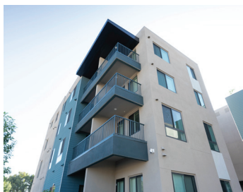
Plaza Ortiz I Cesar Chavez Foundation El Monte, Los Angeles County

Located in the City of South Gate, along a portion of Imperial Highway lined with light manufacturing buildings and automotive repair shops, this urbane, pedestrian friendly, four-story, 60-unit development will serve as a catalyst for the transformation of the neighborhood by providing supportive housing for homeless veterans and homeless individuals with mental illness. Residents are given access to numerous critical, life-changing services, including substance abuse, mental health care, Veterans Administration programs, health and wellness programs, transportation planning, and more. The building has been designed around a central courtyard that is lined with apartments and interior communal space. All of the new homes have large windows and private balconies, allowing breezes and natural light to flood the interiors. Residents can relax on their private balconies with views of the tree-filled courtyard or the cityscape beyond. A large multi-purpose room opens directly to the courtyard, where tenants can engage with one another and participate in a variety of resident activities.