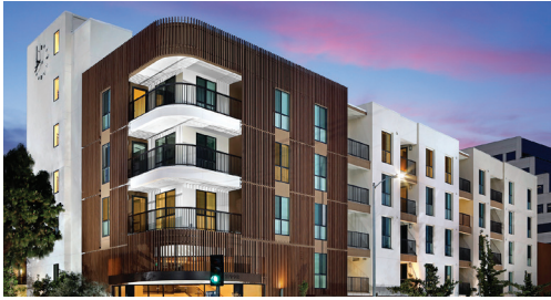
Missouri Place Thomas Safran & Associates City and County of Los Angeles

Missouri Place, located in West Los Angeles, is a 6-story, 74-unit affordable and permanent supportive housing development that showcases how design excellence benefits the community and the spirits of its residents. This project is extra special because it was one of the first supportive and affordable housing projects in the City of Los Angeles to use both HHH funds and the Transit Oriented Communities (TOC) land use incentive program. The project is also special because it is a mix of supportive and affordable housing for both individuals and families developed in West Los Angeles, a high resource area with community groups that have traditionally opposed affordable housing. It includes 44 units for formerly homeless individuals and families along with 29 units for low-income households and one manager unit. The community overwhelmingly supported the project after significant collaboration over many months to arrive at a design and a population mix that represented a true “win-win” to positively impact the community.