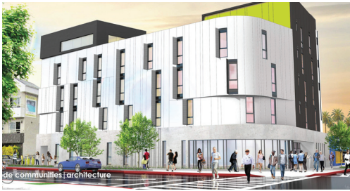
Amani Apartments Wakeland Housing and Development Corporation City and County of Los Angeles

Amani Apartments is one of the first affordable housing communities in Los Angeles to combine supportive housing for unhoused seniors with a Program of All-Inclusive Care for the Elderly (PACE), a specialized senior healthcare system, which has proven highly successful at stabilizing seniors living in supportive housing by providing on- and off-site services, such as medical care, behavioral health, in-home care, and transportation. This model is highly successful at resident retention (90% or higher after one year of operation) and stabilizing residents by offering a wide variety of services. In terms of obstacles overcome, the project site was severely contaminated with environmental hazards, including high levels of lead and cadmium impacted soils due to its previous use as a gas station. The soils required large-scale mitigation and extensive oversight and testing by the California Department of Toxic Substances Control.